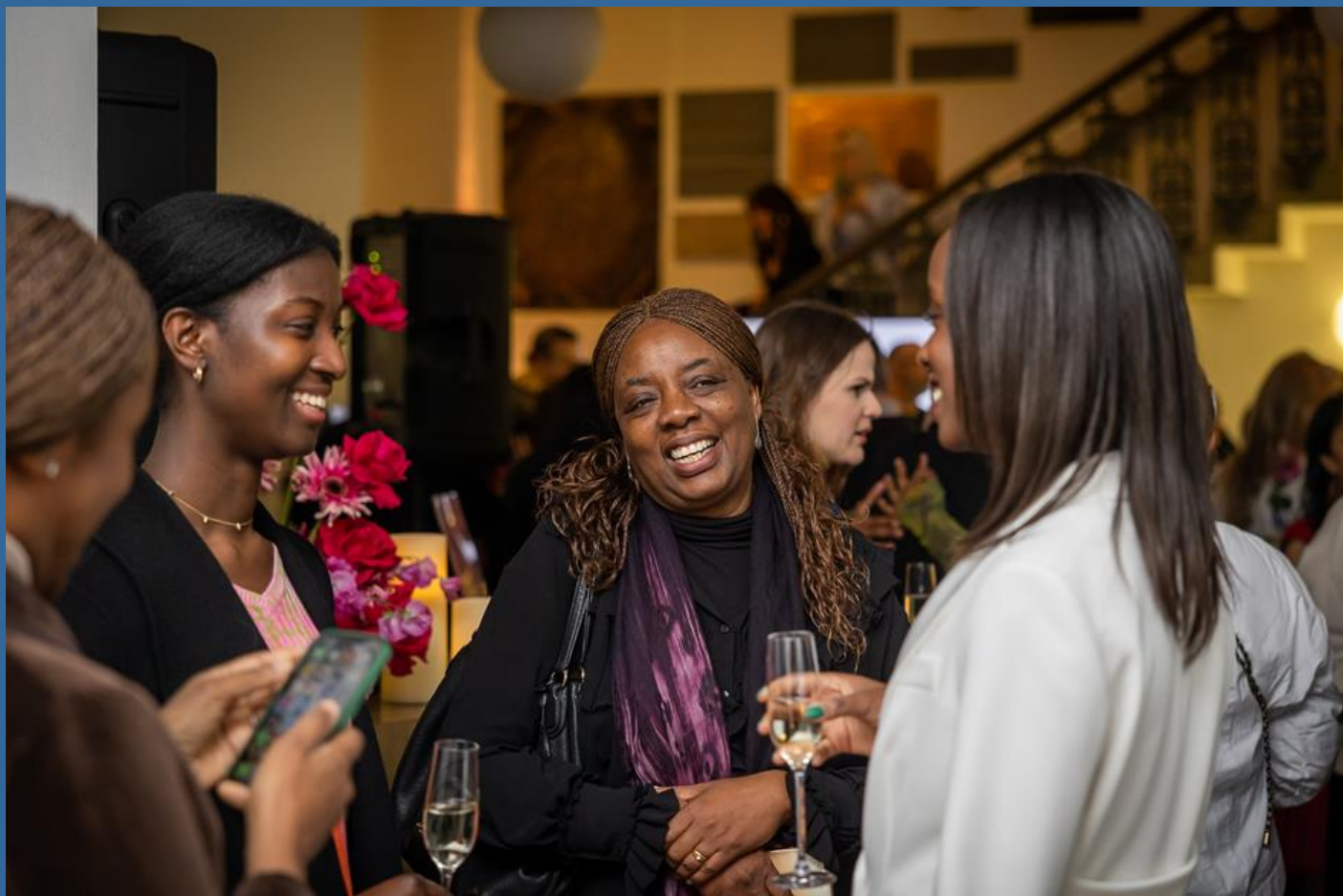
Guests at the Max Mara Art Prize for Women winners announcement 2023.

Bespoke Packages can be created for your individual needs through tailored Family Days for your employees, individual patron benefits, artist-led creative workshops, additional private tours, and workplace talks.