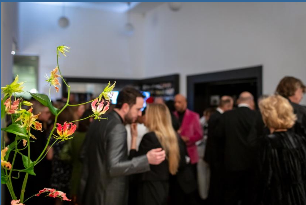
Guests at Art Icon 2023.

Corporate Membership is available from £5,000 + VAT