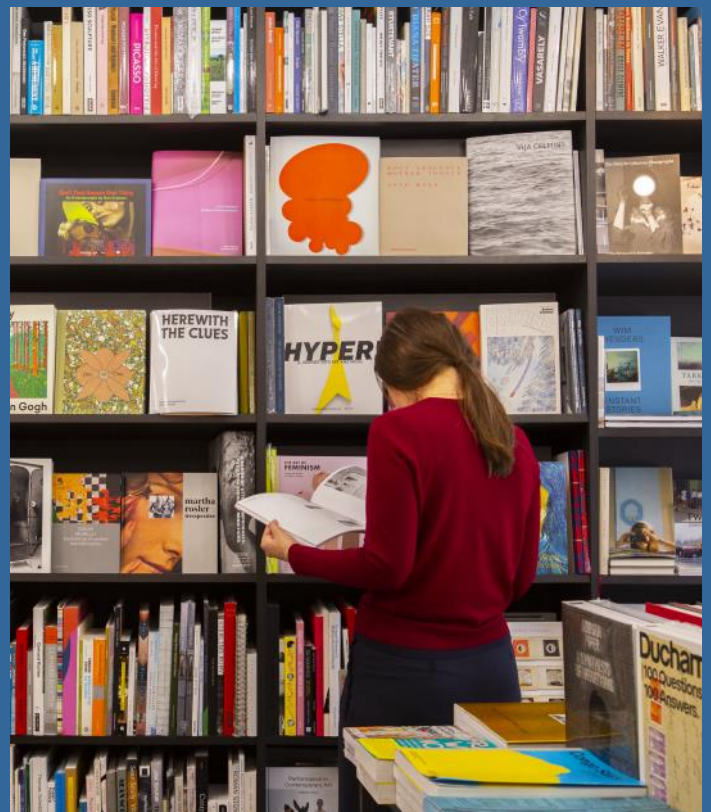
Townsend and The Whitechapel Gallery Bookshop.