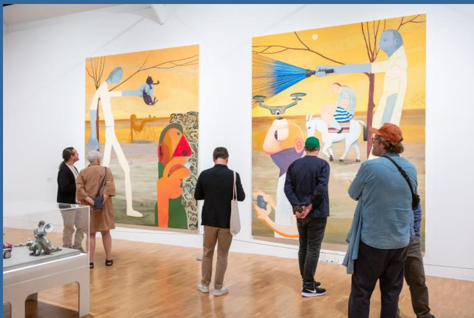
Guests at the Autumn Season Opening 2023.

Visit our exhibitions with an expert as your guide – as a Corporate Member you will receive complimentary private tours as part of your benefits. Book a tour during your event or during public hours. Higher level members can swap a tour for an exclusive workplace talk by one of our Gallery experts.