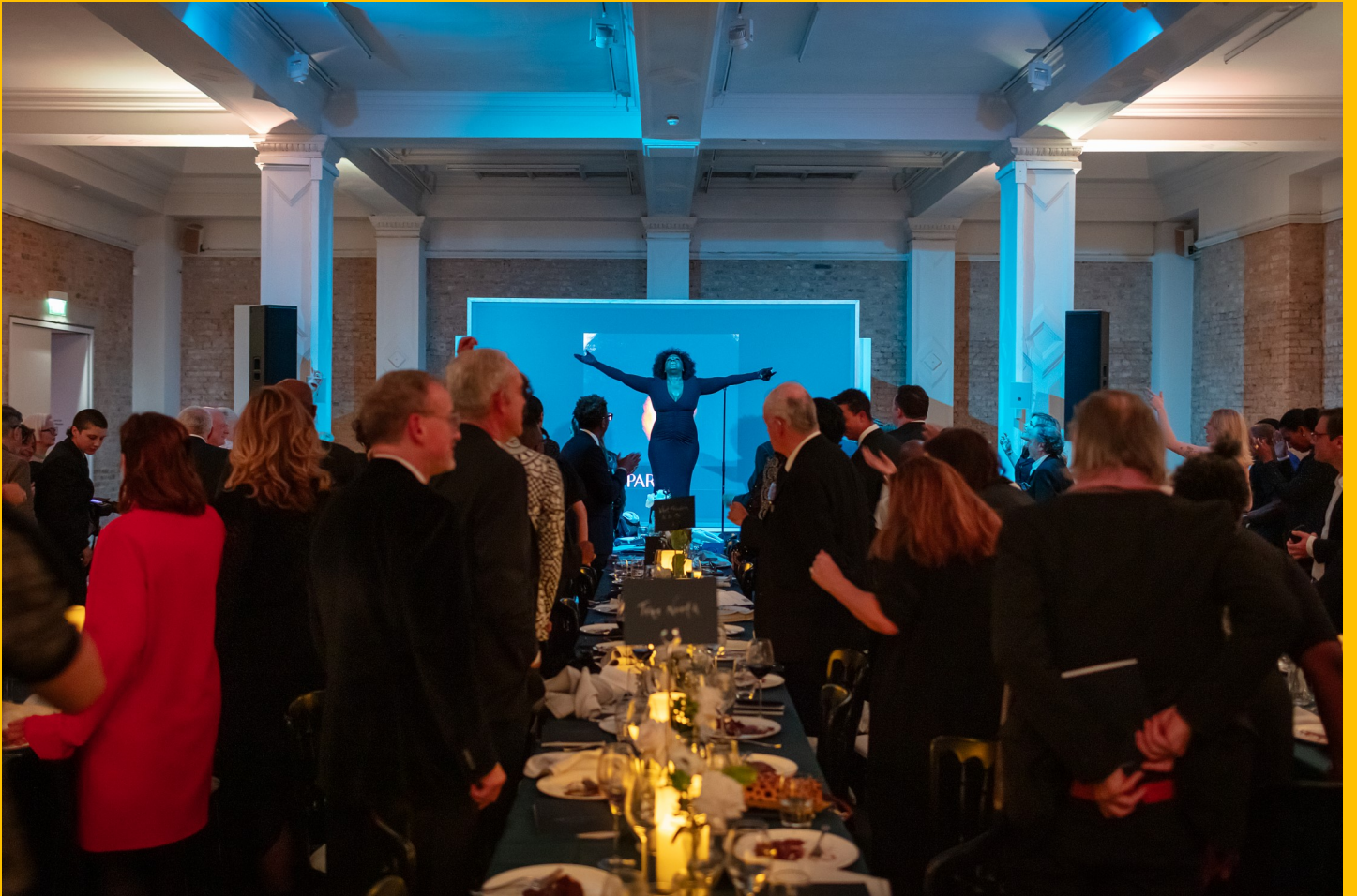
Art Icon 2024 in Gallery 2 .